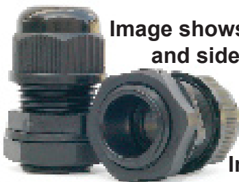
Image shows top view and side view.

Dustless connectors prevent dusts from entering into electrical boxes and panels. A special rubber squeezes down onto round flexible electrical cable to make the dustless seal. On the box side, a nut and washer tighten the connector to the box. CSA approved.