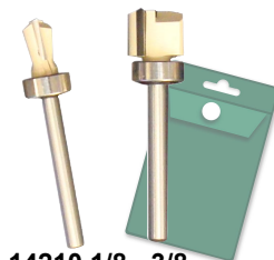
14210 1/8 - 3/8 Router Bit 2 Pc Set

These bits are the companion router bits to our 14205 Thru Dovetail Jig. They allow you to produce the same through-style joint in materials 1/8" to 3/8". They are referred to as #3457 in the manual. Note: if you own a "Keller" jig of the same design, these bits will work for you too.