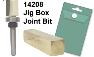
14208 Jig Box Joint Bit