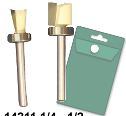
14211 1/4 - 1/2 Router Bit 2 Pc Set

These bits are the companion router bits to our 14205 Thru Dovetail Jig. They allow you to produce the same through-style joint in materials 1/4" to 1/2". They are referred to as #3454 in the manual. Note: if you own a "Keller" jig of the same design, these bits will work for you too.