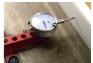
Rip Fence Alignment