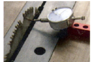
Table Saw Alignment