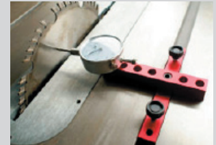
Leveling knobs to adjust for any mitre groove depth.