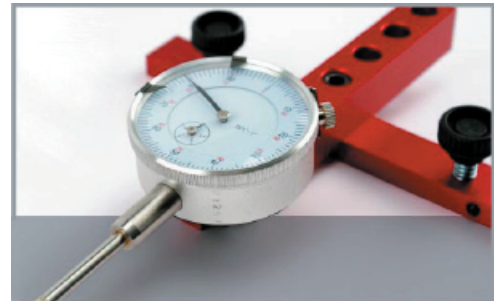
Designed by a woodworker for woodworkers!

The A-Line-It Deluxe includes the extra long mounting bar convenient for checking router arbor run out; the round mounting pin for checking drill press table perpendicularity; the short bar for checking the parallelism of the thickness planer head to the table; the patented saw arbor nut; and the 22 piece dial indicator tip kit for measuring those difficult to reach points on power tools.