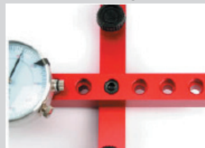
Patented self-adjusting mitre groove bar.