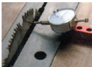
Table Saw Alignment