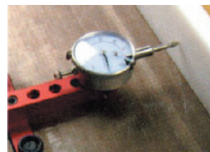
Rip Fence Alignment