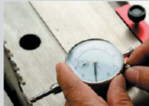
1" Capacity Dial indicator: 0.001" increments for absolute precision.