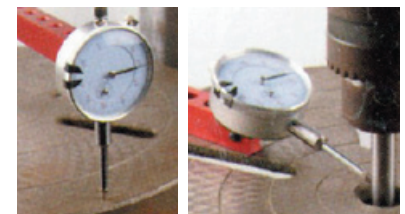
Drill Press Squaring & Drill Chuck Run-out