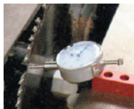
Arbor Flange & Saw Blade Run-out